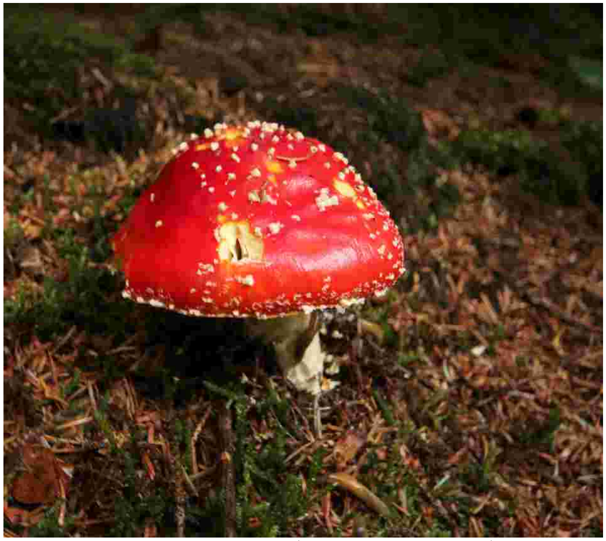
Fly agaric is finally beginning to emerge (taken this afternoon – 25 September) . . .

More encouragingly, over the past week or so the first real—gns of fly agaric have become evident. As one of my guests once announced to me: "Where there's a queen, look for the king!' If you will allow—e to translate, this means roughly, that where you see the delicate, but highly visible, fly agaric, the chances are there is a chunky, but less flamboyant cepe/porcino growing alongside.