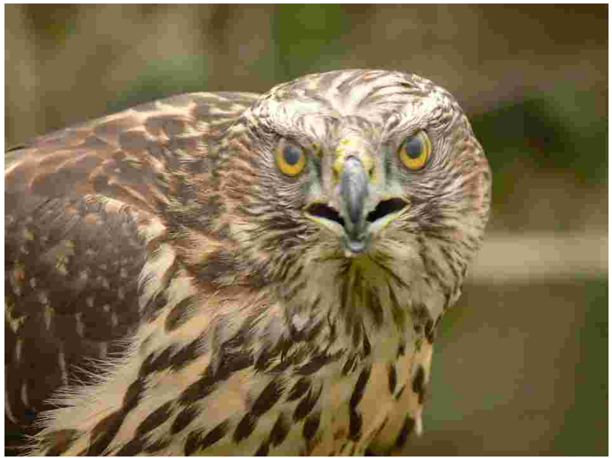
Barbie is just a blushing, tentative, soul . . .

Oh, and just in case it interests any of you, I have a new companion – 'Barbie' – who flew into my life last week. She's a passage female gos who accidentally got trapped in my chicken coop – fortunately for her, I spotted she had a potentially lethal toe infection before I re eased her. Those of you coming on a foray will make her acquaintance.