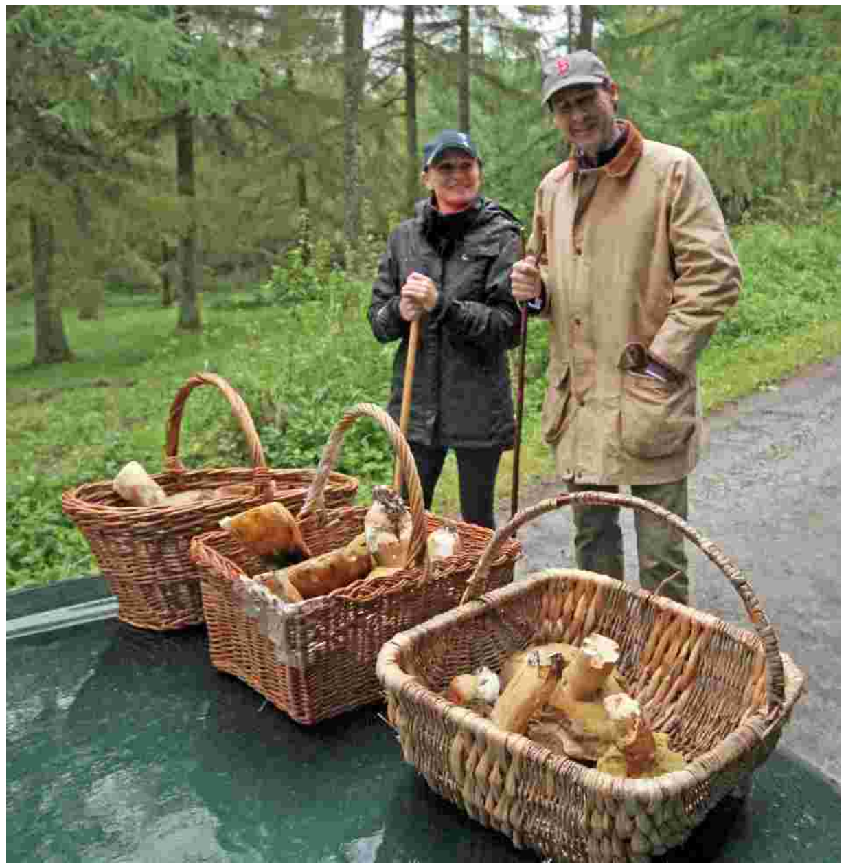
Not a bad haul for a damp September evening – particularly when the gate into the forest was closed . . .

The latest update on the season is that things are loo ing good – good, but not great. Last Sunday (23) I had my first foray and t 17 participants and